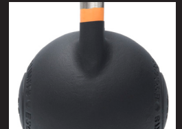
Our most durable finish: powder coated, so the surface won't chip.