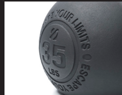
Engraved weights and branding for lifetime performance.