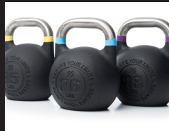
Uniform bell size to allow easy progression through different weights.