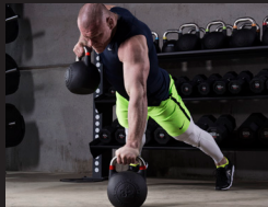
Attractive design and easy to identify weights.